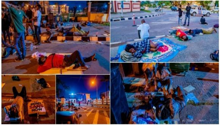
Figure 4: #EndSARS protesters asleep at the Lagos House of Assembly (Ososanya, 2020)

converging points of the protests in Nigeria were the Nigerian National Assembly complex in Abuja, the Lekki tollgate in Lagos, and other strategic locations in the country. The protesters at some of the protest sites were seen to sleep there for days, waiting for the government to respond to their demands. Protesters conducted Friday and Sunday services for Muslim and Christian worshippers respectively at these venues. The figures below indicate protesters sleeping and camping at the Lagos State House of Assembly and at the Lekki tollgate: