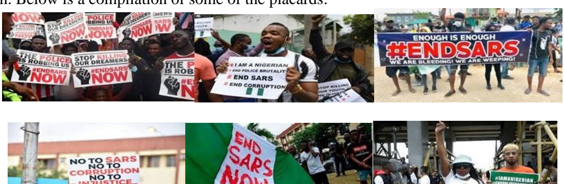
Figure 3: #EndSARS protesters with different placards (West, 2020; Lawal, 2020; Nsemgh, 2020; Bolashodun, 2020)

This protest wave was sparked some days prior to Nigeria's 60<sup>th</sup> Independence Day celebration in 2020. The Nigerian masses felt that there was nothing to celebrate in a country witnessing political unrest, terrorism and the extrajudicial killings of citizens 60 years after gaining independence. They felt that instead of an Independence day celebration, worldwide protests had to be staged to demand better governance and to end police brutality in the country. The protests were set to continue until the Nigerian government yielded to the requests of its citizens. The venues and times of the protests were communicated across the social media platforms and Nigerians in the diaspora made their intentions to participate in the planned protests known on the same platforms. The protests commenced in Nigeria and the diaspora early on the morning of October 1 2020, the day of the independence celebration. Nigerians were seen out marching in their thousands, holding placards with various hashtags such as #EndSars, #EndSarsNow, #EndBadGovernenanceInNigeria, #EndPoliceBrutality, #ReformPoilceNG and so on. Below is a compilation of some of the placards: