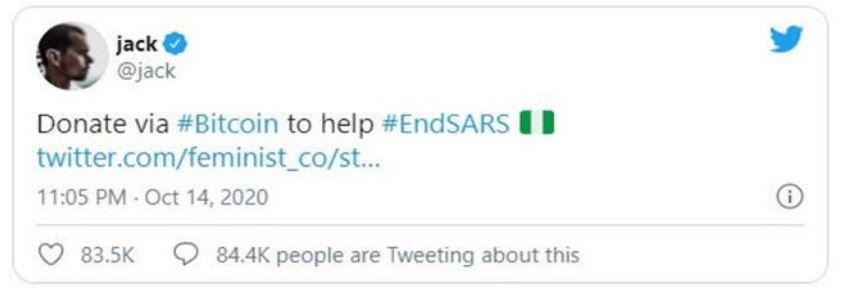
Figure 7: Twitter CEO endorses the #EndSARS protest (Dorsey, 2020)

The Nigerian government, rather than address the numerous demands of the protesters, again announced a change of the unit's name, from the Federal Special Anti-Robbery Squad (FSARS) to the Special Weapon and Tactical Team (SWAT). This announcement was met with displeasure from the masses protesting on the streets as they saw the announcement as a media tactic to silence them and to make them leave the streets. The protests continued despite the announcement. The sleeping and camping also continued for two weeks following the October 1, 2020 Independence celebration. During the first two weeks, the #EndSARS hashtag gathered momentum on social media, and on Twitter especially, with the daily use of the hashtags in reporting the atrocities of the men of the FSARS, now SWAT. This caught the attention of the founder and CEO of Twitter, Jack Dorsey, who afterwards gave the #EndSARS hashtag a Nigerian flag, so that whenever a user typed/tweeted '#EndSARS', the Nigerian flag would appear right after it. A special Bitcoin account was also created by Dorsey to support the protests (Dorsey, 2020). (See Figure 7 below).