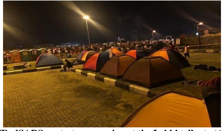
Figure 6: #EndSARS protesters camping at the Lekki tollgate (Ajayi, 2020).