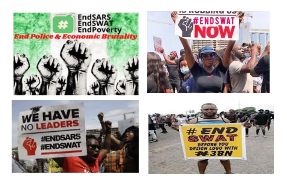
Figure 8: New protests hashtags (Eco Information 2020; Anwana, 2020; Tero 2020)

Immediately following the announcement of the unit's name change from SARS to SWAT, new hashtags emerged on the social media platforms such as #EndSWAT, #EndSWATNow, #EndPoverty, and so on (See Figure 8 below).