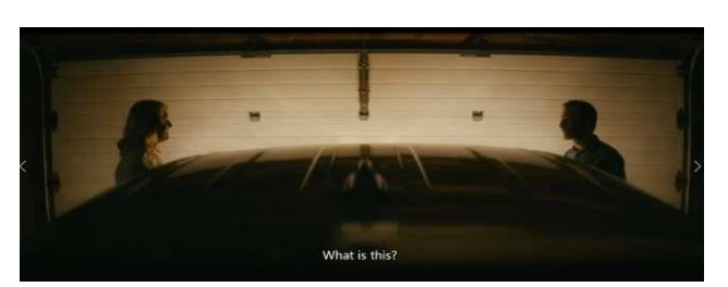
Figure 4. 9 Hutch Promises