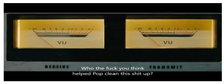
Figure 4. 5 Hutch Has An ambition to revenge

He proofs the real identity of himself by story-telling until they have been died on the spot, during the speech. The ambition called "self-attitude" A person who is ambitious attempts to learn from his or her wins and losses; setbacks fuel his or her resolve to achieve. "I am as excellent as anybody," unhappiness with oneself and one's accomplishments, sensitive to criticism All of this contributes to the idea that a person is working hard to cultivate particular characteristics.