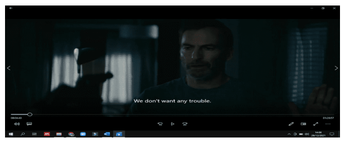
Figure 4. 1 Hutch and the criminals