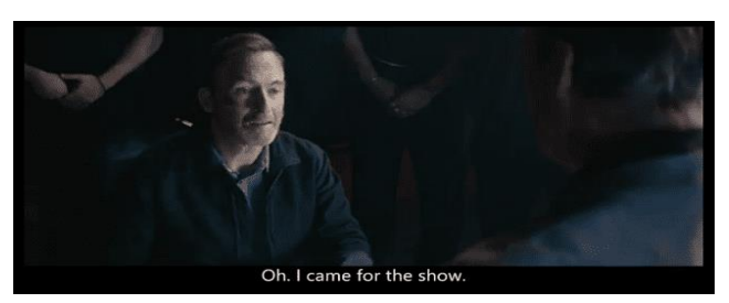
Figure 4. 62 Hutch Meets Yulian to revenge

Lingua (2023), 20(1): 10~31. DOI 10.30957/lingua.v20i1.809.