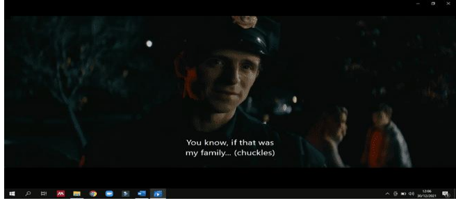
Figure 4. 3 Police Officer Investigation

. He tries to control his ego, the desire to reach his killer instinct but ego does not affect Hutch as the leader of his own family. He knows that he must be protect his family by letting the criminals take what they want without too much argue and compromise. He commits that he must be a better man for his kids, wife and family.