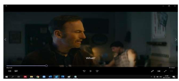
Figure 4. 8 Hutch Finding the Criminals "Hutch Looking for the criminals to find the cat bracelet."