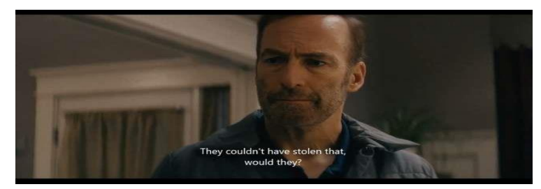
Figure 4. 7 His Daughter Have Lost the Cat Bracelet